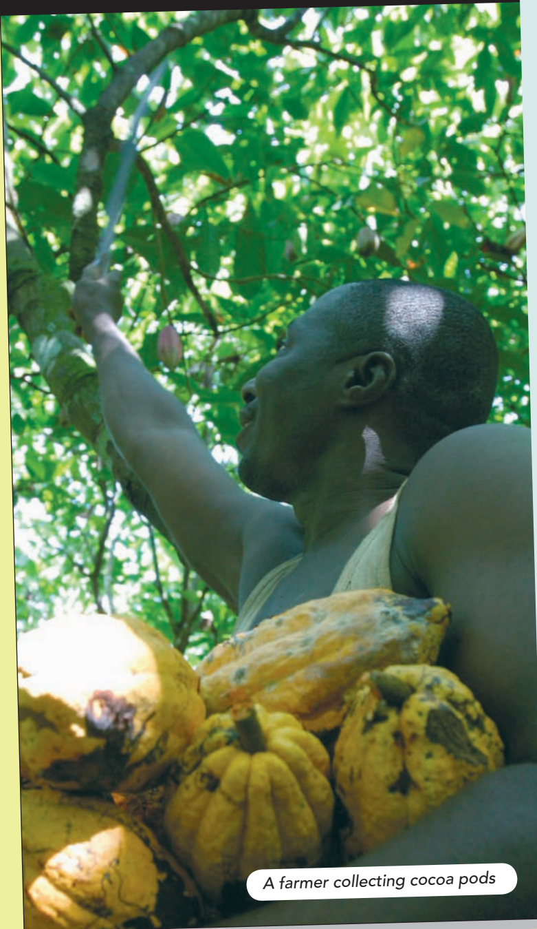
A farmer collecting cocoa pods