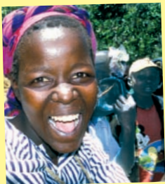
Children in Lucy's village

The extra money that these farmers now earn has helped transform completely the lives of people in the whole community. Their situation has been dramatically improved and they can finally take control of their own lives. Lucy explains: 'In our village, we decided to build a brand new well, so at long last we have our very own supply of clean water. Now my children can even go to school. It makes all the hard work worthwhile.'